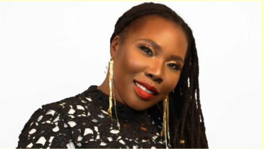
2018 Photoshoot by Mamba Lifestyle. Click image above to visit Instagrm page