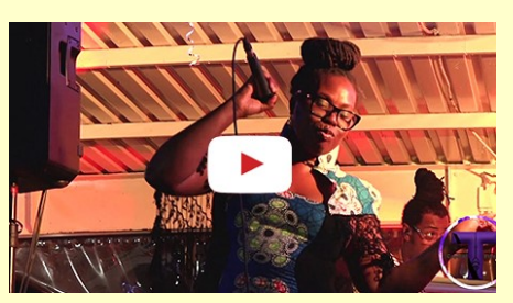
Sept 2018, Obsession III Boat trip