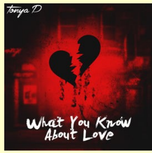
Click Image above to listen to track.