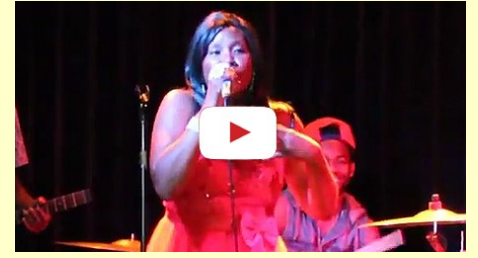
Live at the Waterfalls Saturday July 13 2013