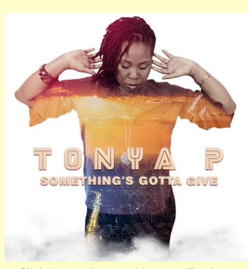
Click image above to Listen to Track